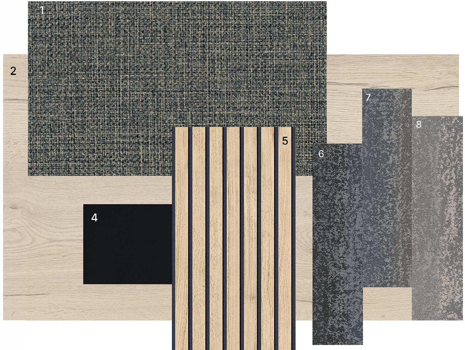
1. Hessian Blue Wall Covering | 2. Wooden Table Top | 3. Stackable Chair with Arms, Polypropylene Back in Cement Grey & Fabric Seat Pad | 4. Black Table Leg | 5. Natural Timber Slat Wall Panel | 6.7.8. Textured Effect Grey Mix Carpet Planks